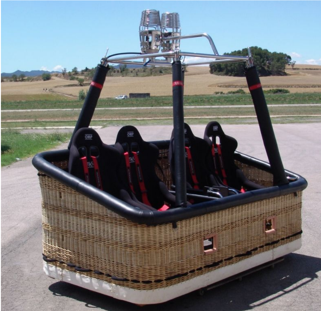
The VISTA 4 basket.

Ultramagic are proud to announce the VISTA basket!